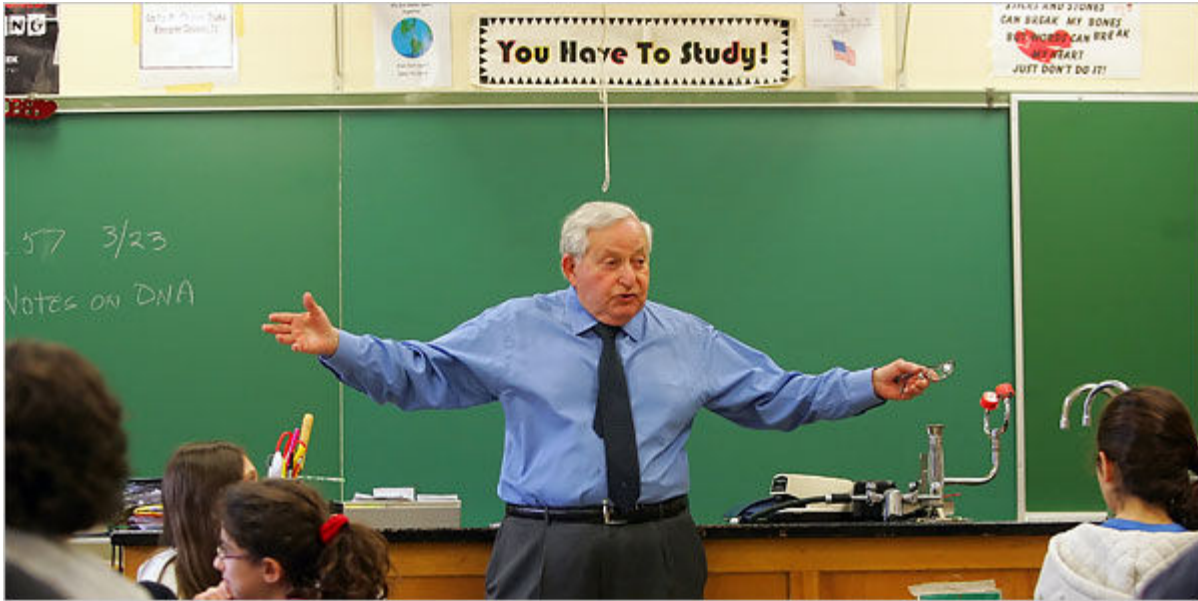
The Mayonnaise Jar

When things in your life seem, almost too much to handle, When 24 Hours in a day is not enough, Remember the mayonnaise jar and 2 cups of coffee.