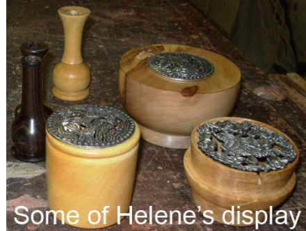
Some of Helene's display